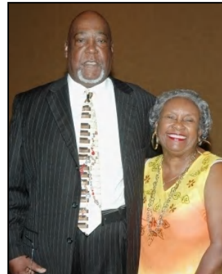
Enjoying the festivities