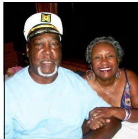
Boat ride on Lake Norman