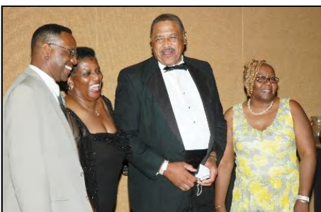
Enjoying the festivities