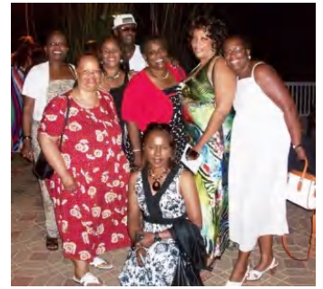
Boat ride on Lake Norman