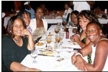
Boat ride on Lake Norman