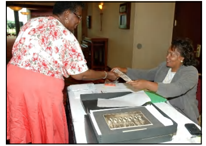
Archived photos on display for ID's