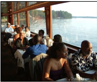
Boat ride on Lake Norman