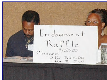
Raffle helped put it over the top!

A big thank-you to those who contributed during the past two years. But we're just getting started!