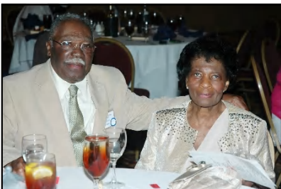
Enjoying the festivities