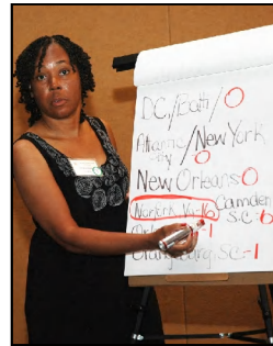
It's Norfolk in 2014!