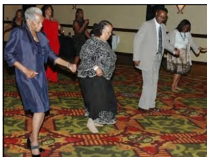
Dancing the night away