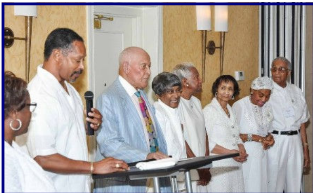
SALUTE TO SENIOR ALUMNI ATTENDING