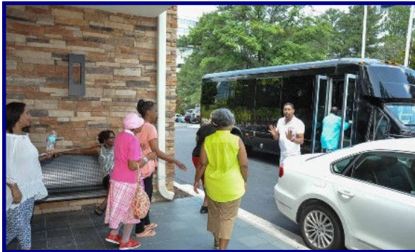
BUS TOUR OF HISTORIC BLACK ATLANTA