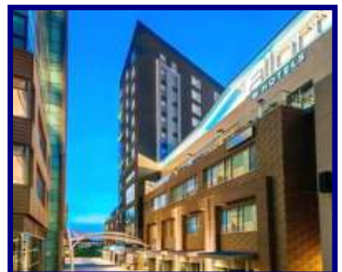
Aloft Greenville Downtown Hotel

5 North Laurens St., Greenville, SC 29601