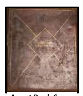
Arrest Book Cover